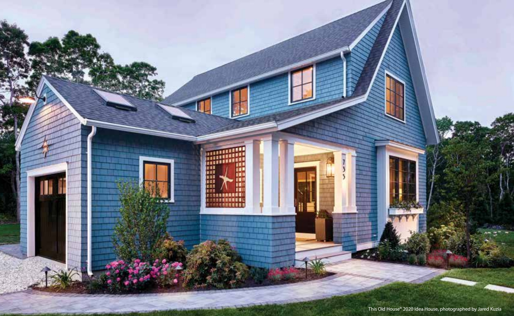
This Old House® 2020 Idea House