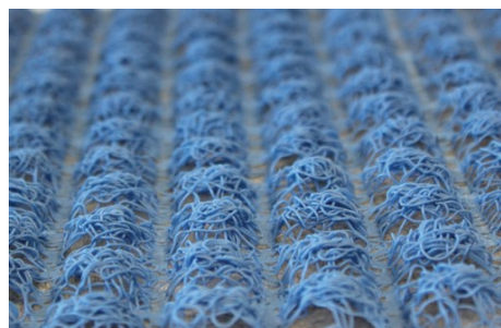
Mortairvent® (.40 in. / 10mm)