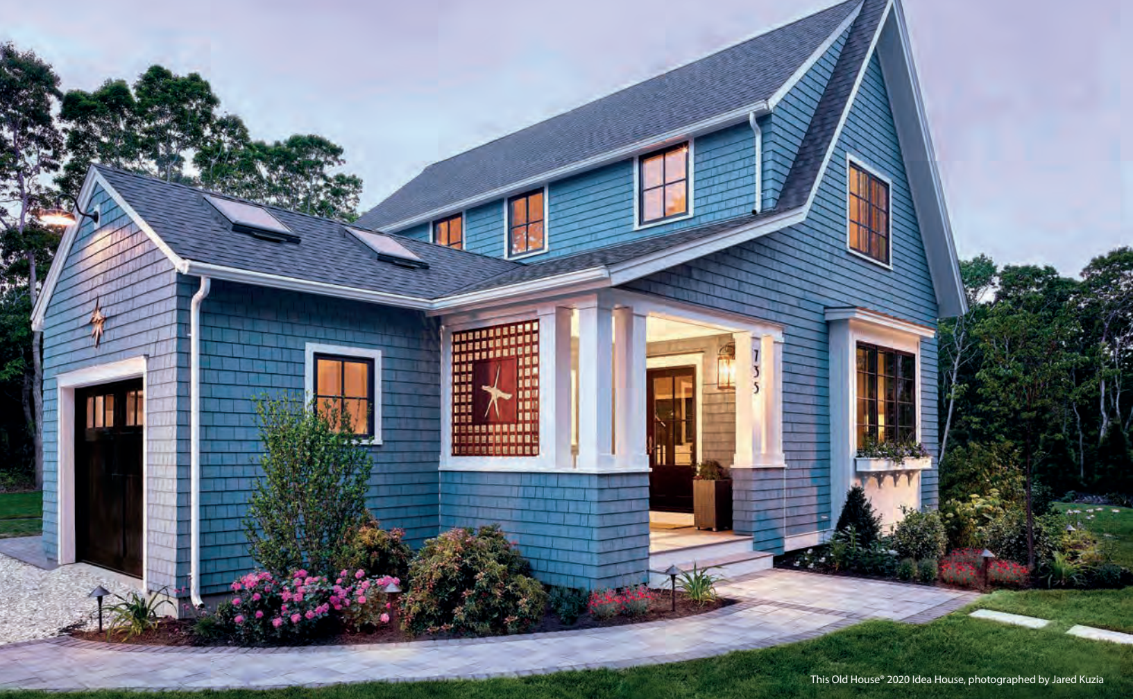
This Old House® 2020 Idea House, photographed by Jared Kuzia