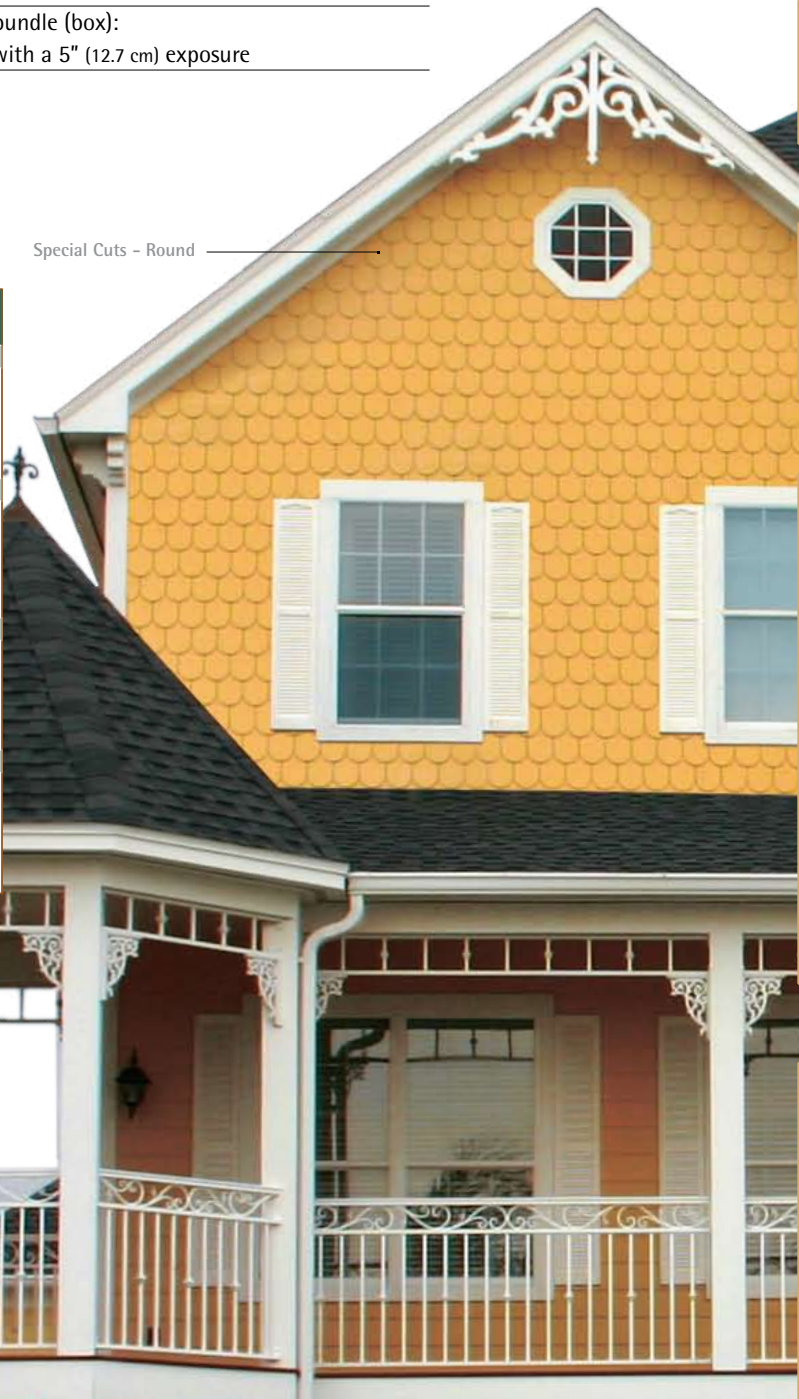
Special Cuts - Round